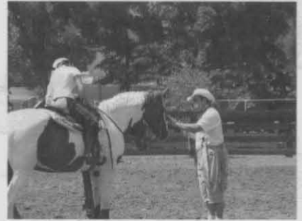
Holiday blessings cont. from pg. 1

The California Film Commission has created a booklet called "Your Property in a Starring Role." This guide provides important information and sample contracts for those who are interested in this opportunity. The California Film Commission has a location library which features pictures of locations around the State. The Commission also maintains a list of location managers and production companies which they will mail to you. This will allow you to mail a brochure with pictures of your house directly to the people who scout for locations. The California Film Commission's number is (323) 860-2960.