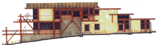
Architectural history in the making.